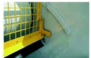
Safety system hopper grill .