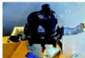
Ref . 46243 water counter.