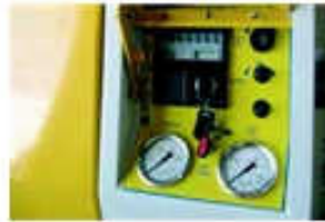
Electric control panel.

Always ask for original tools and spare parts . Due to continuous improvement and development all machines can be modified without previous advice.