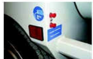
Several greasing points .