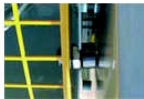
Safety system mixer.