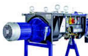
* figure: D10-III with optional stand and bag inlet hopper