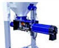
* figure: D10-III at piccolo silo