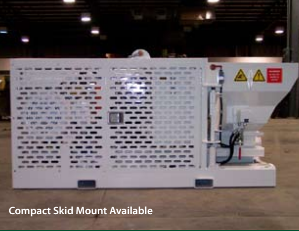
Compact Skid Mount Available

Designed for Demanding Shotcrete Applications