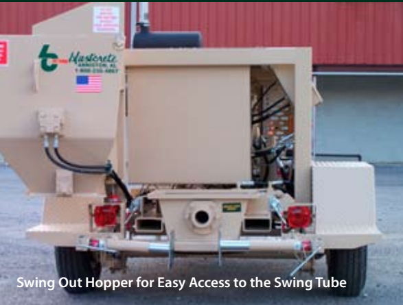
Swing Out Hopper for Easy Access to the Swing Tube