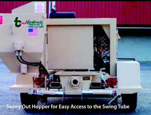
Swing Out Hopper for Easy Access to the Swing Tube