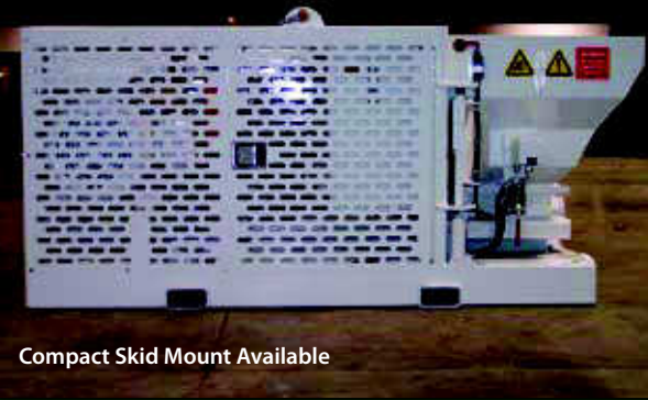
Compact Skid Mount Available

Designed for Demanding Shotcrete Applications